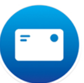
ID Cards Medical, Vision, Dental