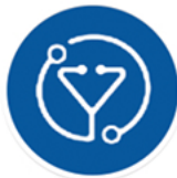
Quality Care Connect