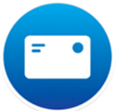
ID Cards Medical, Vision, Dental