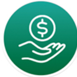
Health Reimbursement Account