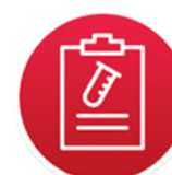
Covid Test Results