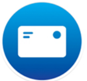
ID Cards Medical, Vision, Dental