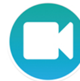
Open Enrollment Videos